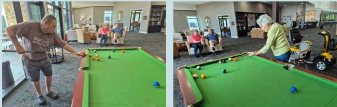
Pictured above: Our pool table is always popular among the residents and our visitors.