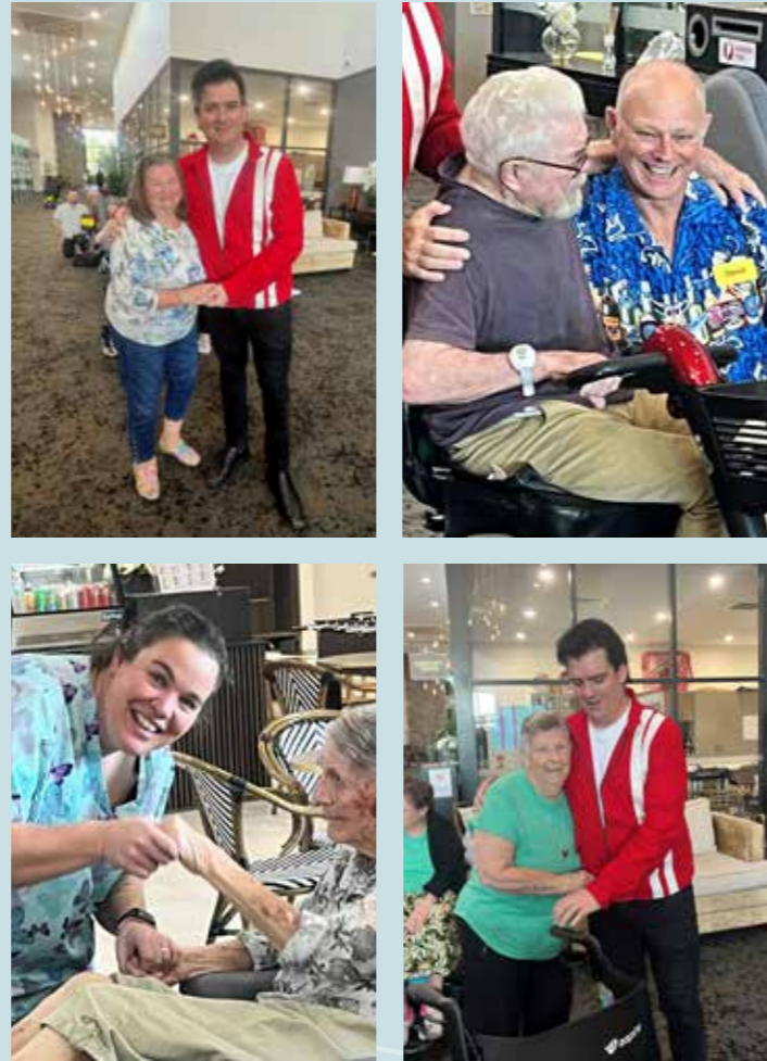
Pictured above: Elvis has entered the building! We love a visiting musical entertainer and Elvis is up there with our favourites!