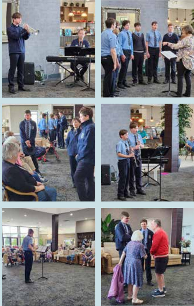
Pictured above: These students of St Mary's College, Toowoomba, joined us for a very professional musical recital recently. The boys were very mature and interacted with our residents very well. Our residents said they were very impressed by the choir and the show band, which performed many varied acts. The cherry on top was that the students walked around and talked with our residents after the show. It was such a lovely visit.