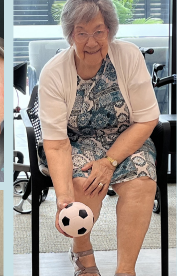
Pictured left and below: Ball sports keep our bodies active and our hand-eye coordination on point.