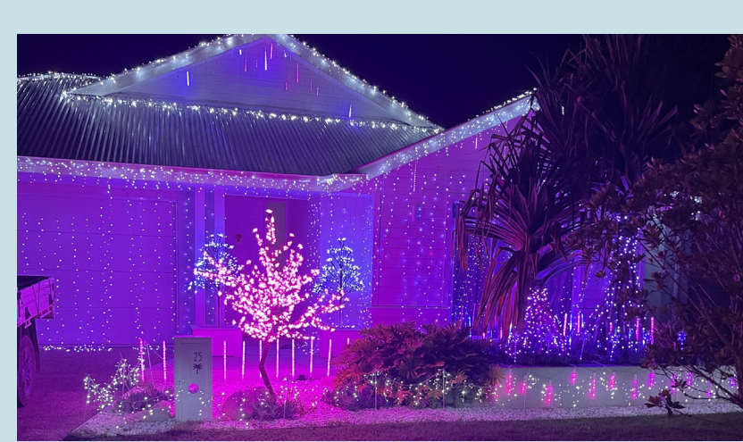
Pictured left: Our Christmas lights bus trip brought back so many memories for those onboard. We agreed that it doesn't matter your age - Christmas lights are a delight for anyone and everyone!