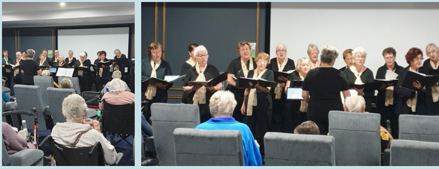
Pictured above: The Bribie Island Gallery Singers stopped by and entertained us with their voices recently. They are a really talented group and we already look forward to having them stop by again later in the year.