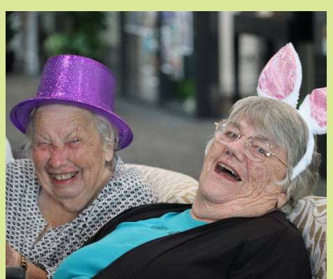
Pictured above: Easter was a wonderful celebration filled with happy days and chocolate delights!

Pictured below: Volunteer Recognition Day was a wonderful event that allowed us to show our heartfelt thanks to our volunteer helpers. We gifted them with a little something from our residents and staff, honouring the efforts and time they so generously give. We are so grateful for all they do to support us.