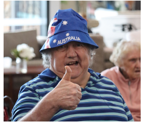
Pictured this page: Aussie, Aussie, Aussie? Oi, Oi, Oi! We had a memorable day on January 26 as we celebrated all the things that make our land downunder so special.