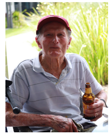
Pictured this page: More memories from our regular Tuesday lunch community barbecues. We love that so many visitors pop by to spend time with their loved ones - and it's no secret that our smallest visitors might just be our favourites! We hope to see you here at a weekly barbecue soon.